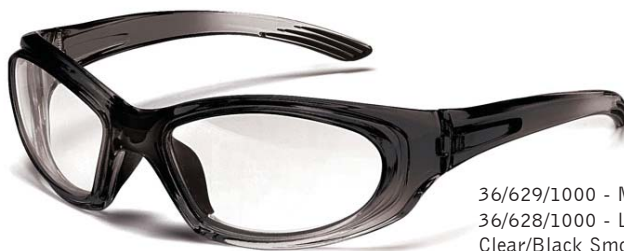
36/629/1000 - M 36/628/1000 - L Clear/Black Smoke

Meets ASTM F803 Impact Standards: Basketball, Racquetball, Paddleball, Tennis, and Squash