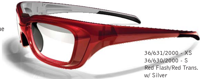
36/631/2000 - XS 36/630/2000 - S Red Flash/Red Trans. w/ Silver

Meets ASTM F803 Impact Standards: Basketball, Racquetball, Paddleball, Tennis, and Squash